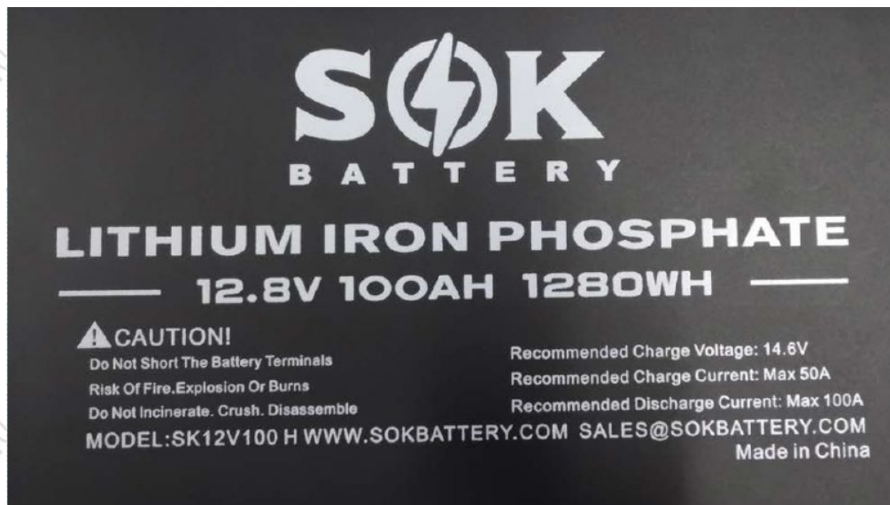
Figure 3 Battery Label (标签图)