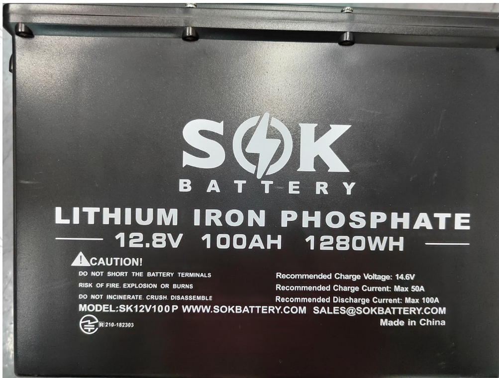
Figure 3 Battery Label (标签图)