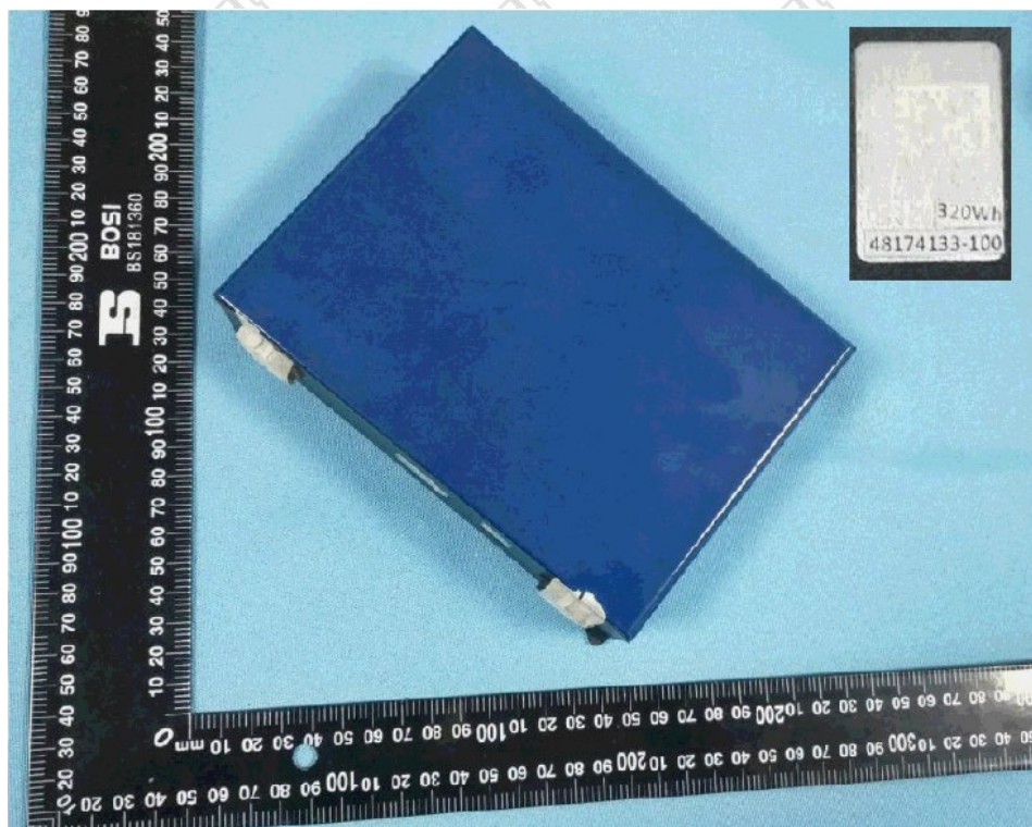
Figure 4 Overall view of cell (电芯图)