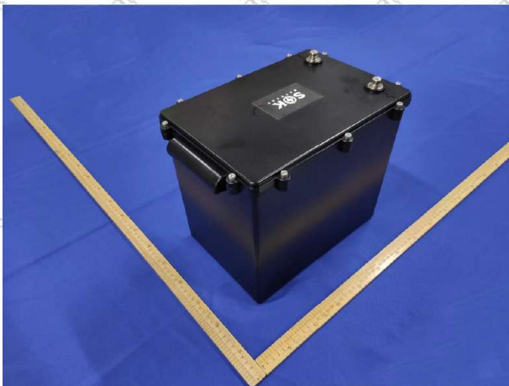
Figure 2 Overall view II of battery (外观图II)