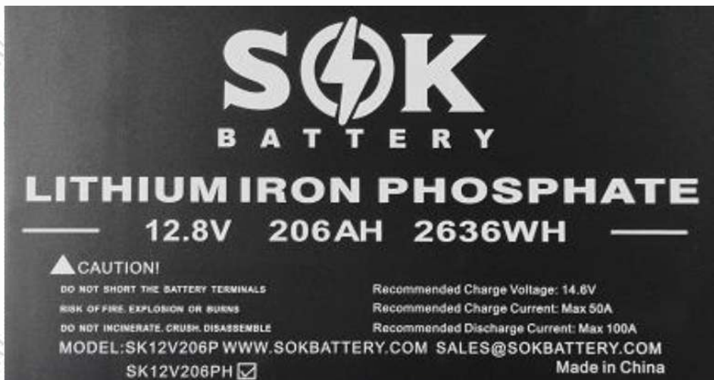
Figure 3 Battery Label (标签图)