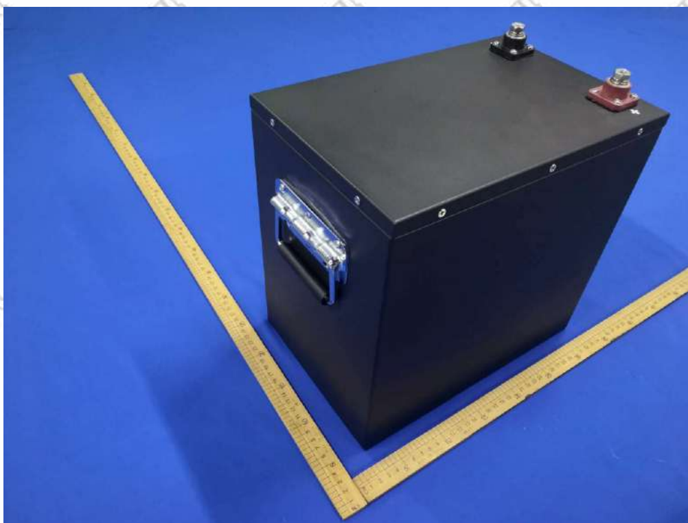
Figure 2 Overall view II of battery (外观图II)