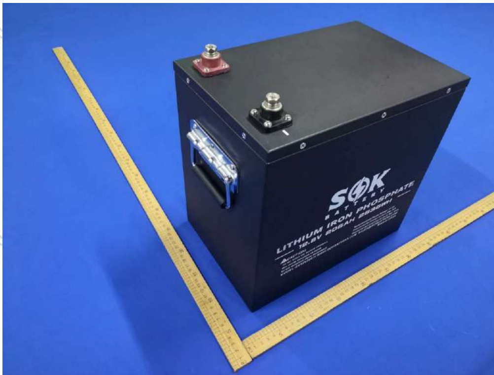
Figure 1 Overall view I of battery (外观图I)